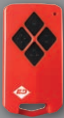
B&D Remote Opener