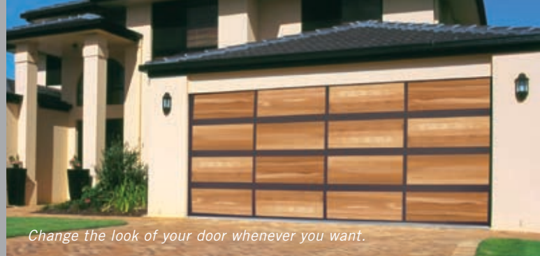
Change the look of your door whenever you want.