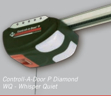
Controll-A-Door P Diamond WQ - Whisper Quiet